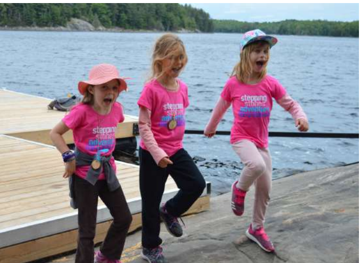
Start the day off with some high energy camp songs!

The program is perfect for girls who are looking to take the first step in their overnight camping experience as well as for campers who are eager to make the transition to our summer programs.