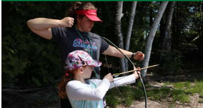
Learn how to shoot a bow and arrow at archery!