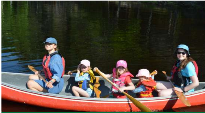
Enjoy a paddle with new friends on the lake!